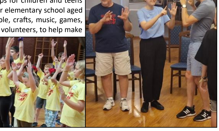
who showed up for each meeting. Most of them became a core group that were consistent in coming every time, and we are coming to

the camp happen. Most of them were once campers themselves. Most of these teens came in July to our Youth Camp, a residential camp for teens in the mountains. The theme was, What's Love Got To Do With It?, after the old pop song of that name. Our band learned this song for the camp and also led worship. For our main Bible lessons, we took lines from that song and made spiritual applications from them. One line is, "Who needs a heart when a heart can be broken?" We looked at scriptures that talk about Jesus as the solution, and the only safe place for our broken hearts.